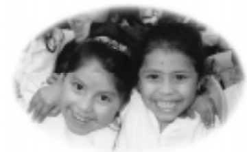
Your gift will help keep us smiling!

Return this form with your gift in the enclosed envelope. You will receive a tax-deductible receipt. Please make checks payable to: