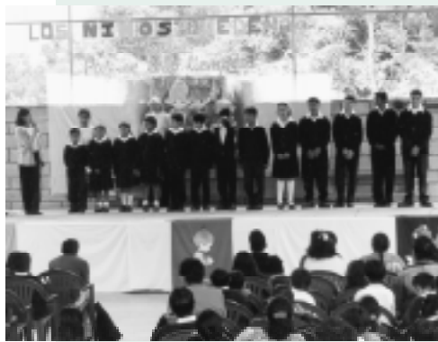
Sixth grade graduating class.