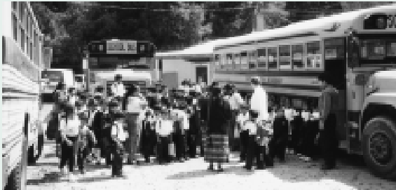
Children getting on buses.