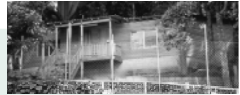
Main building consists of offices, dining rooms and kitchen.