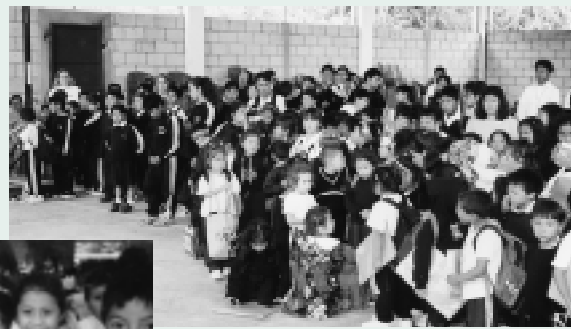
Children in gym for closing event of each school day.