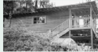
Kari's residence building.